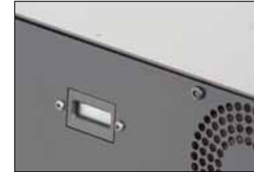
The cycle counter