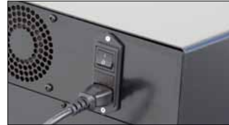
The main power connector

At the backside of the degausser you will find the main power connector as well as the Cycle counter display. The Cycle counter display displays the number of cycles the degausser has performed in total. The display cannot be reset.